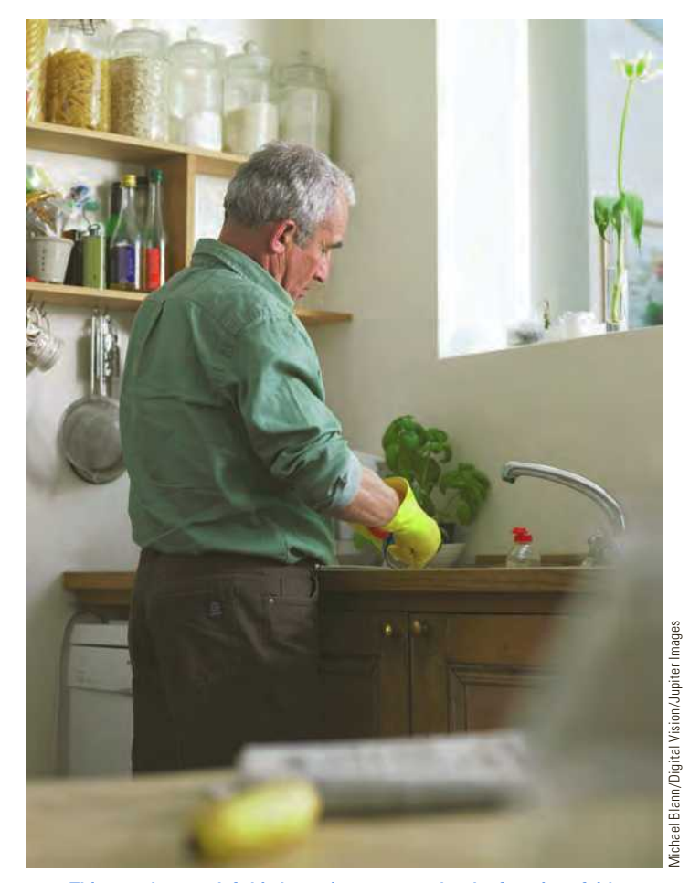
This man has not left his home in two years, but he functions fairly normally and is not distressed. Is his behavior abnormal?

Our discussion to this point might suggest a person's behavior is either abnormal or not, but this is not really so. Along with