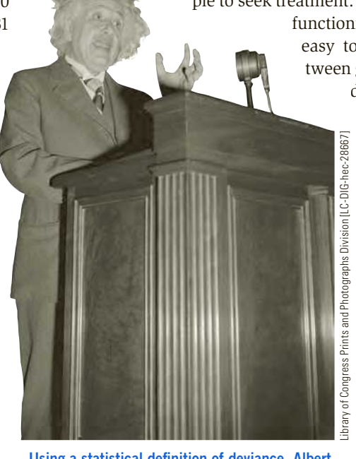
Using a statistical definition of deviance, Albert Einstein would be considered "abnormal" because of his high intelligence.